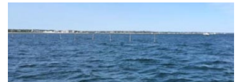
Harding Beach Fish Trap Facility on Cape Cod