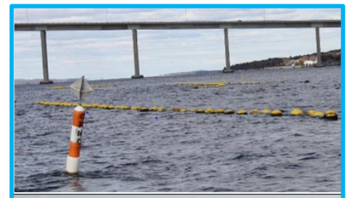
An oyster farm located in Narragansett Bay in Division 7