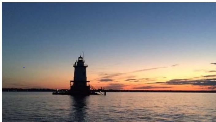
A view from the QUINSEA on a recent evening patrol in Narragansett Bay

Navigation Systems has important Coast Guard business to complete each year and we need every AV’s and NS Staff Officer’s support from skilled and trained Auxiliarists in every Division of First Northern in order to meet our annual Coast Guard goals.