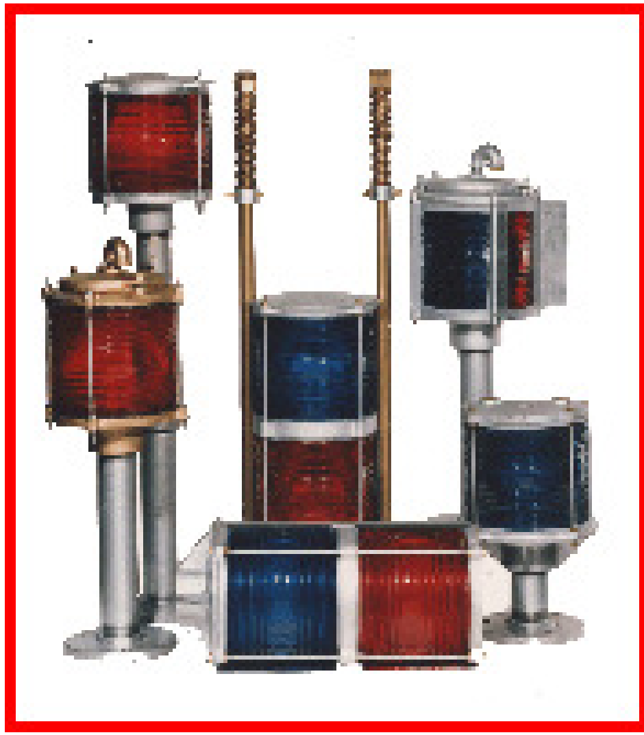
Samples of various bridge lights

Plan to visit our exhibit at the April Spring Conference in Newport RI on April 9 and 10. Experienced AVs will be available to answer your questions and discuss the various Navigation Systems programs. AV check offs will be available. Look for the Aid to Navigation display of buoys and blinking lights.